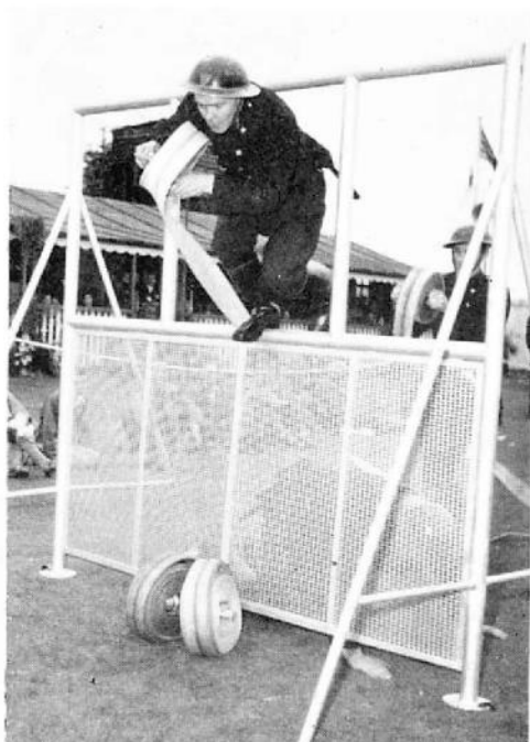
First man of the Acton team through the window in the Heavy Pump drill. His teammate kneels in front of the window as a human spring-board for all the jet men