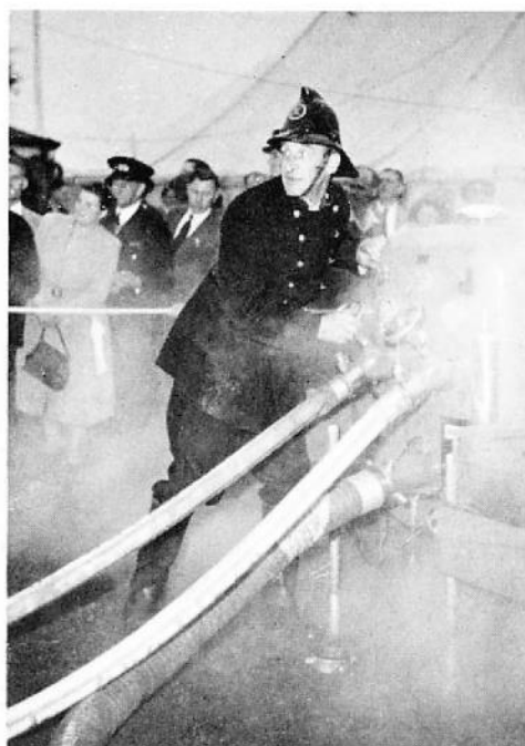
Stafford's Heavy Pump man anxiously watches the water speeding along the hoses to the jets still being connected, hoping that his team will beat Chelmsford's time