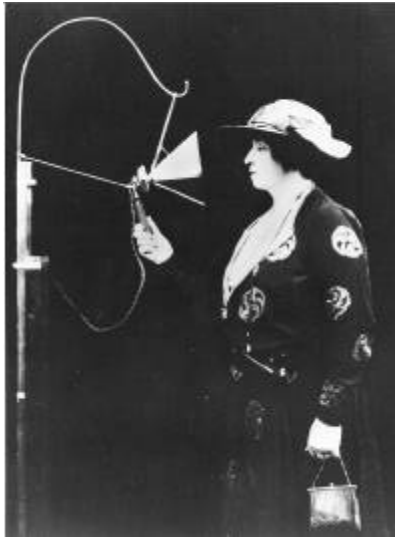
Image caption: Dame Nellie Melba sings across the airwaves at the Marconi studio on 15 June 1920.